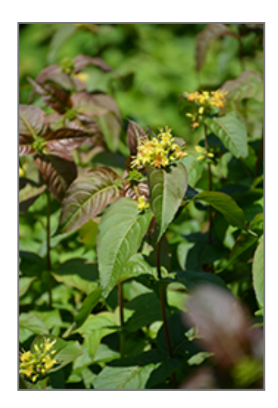
Kodiak Black Diervilla flowers

7036 Nieman Shawnee, KS 66203 913.631.6121