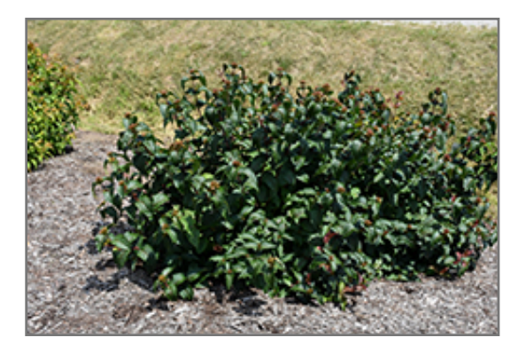
Kodiak Black Diervilla