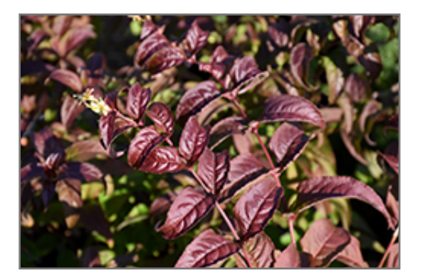
Kodiak Black Diervilla foliage

Kodiak Black Diervilla will grow to be about 4 feet tall at maturity, with a spread of 4 feet. It tends to fill out right to the ground and therefore doesn't necessarily require facer plants in front. It grows at a medium rate, and under ideal conditions can be expected to live for approximately 20 years.