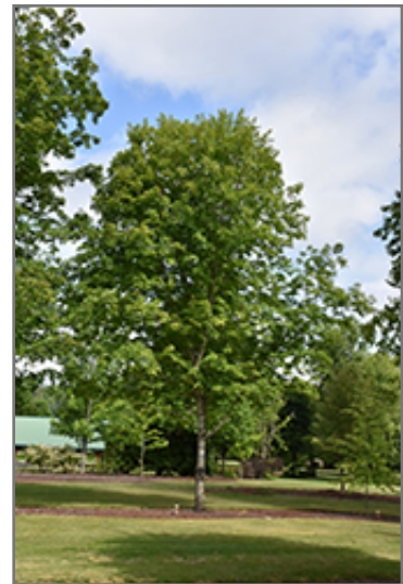
John Pair Sugar Maple