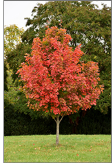
John Pair Sugar Maple in fall