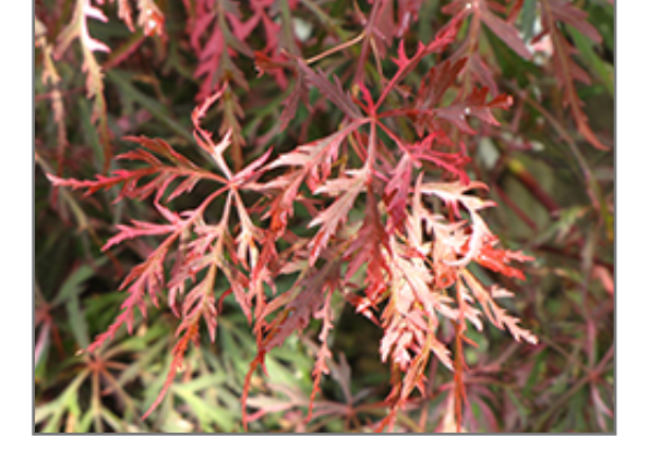
Hana Matoi Cutleaf Japanese Maple foliage

8424 Farley St. Overland Park, KS 66212 913.642.6503