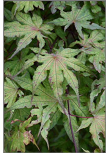
Amber Ghost Japanese Maple foliage