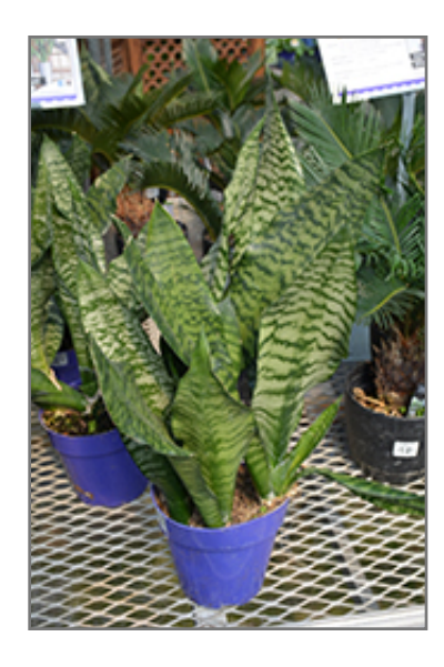
Futura Robusta Snake Plant

Futura Robusta Snake Plant's attractive large twisted narrow leaves remain grayish green in color with showy dark green variegation and tinges of silver throughout the year on a plant with an upright spreading habit of growth.