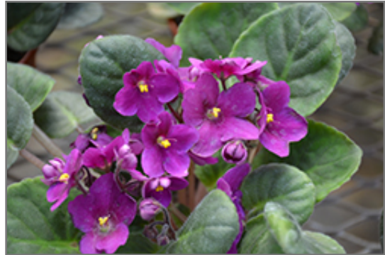
Hybrid Purple African Violet flowers

There are many factors that will affect the ultimate height, spread and overall performance of a plant when grown indoors; among them, the size of the pot it's growing in, the amount of light it receives, watering frequency, the pruning regimen and repotting schedule. Use the information described here as a guideline only; individual performance can and will vary. Please contact the store to speak with one of our experts if you are interested in further details concerning recommendations on pot size, watering, pruning, repotting, etc.