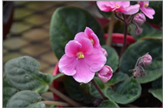
Hybrid Pink African Violet flowers

There are many factors that will affect the ultimate height, spread and overall performance of a plant when grown indoors; among them, the size of the pot it's growing in, the amount of light it receives, watering frequency, the pruning regimen and repotting schedule. Use the information described here as a guideline only; individual performance can and will vary. Please contact the store to speak with one of our experts if you are interested in further details concerning recommendations on pot size, watering, pruning, repotting, etc.