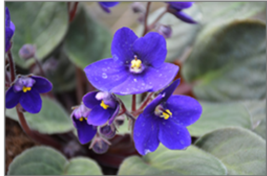
Hybrid Blue African Violet flowers