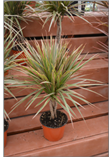
Colorama Dracaena in full

When grown indoors, Colorama Dracaena can be expected to grow to be about 3 feet tall at maturity, with a spread of 24 inches. It grows at a medium rate, and under ideal conditions can be expected to live for approximately 10 years. This houseplant performs well in both bright or indirect sunlight and strong artificial light, and can therefore be situated in almost any well-lit room or location. It does best in average to evenly moist soil, but will not tolerate standing water. The surface of the soil shouldn't be allowed to dry out completely, and so you should expect to water this plant once and possibly even twice each week. Be aware that your particular watering schedule may vary depending on its location in the room, the pot size, plant size and other conditions; if in doubt, ask one of our experts in the store for advice. It is not particular as to soil type or pH; an average potting soil should work just fine.