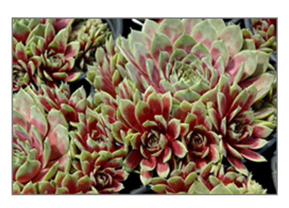
Commander Hay Hens And Chicks

This is a dense herbaceous houseplant with tall flower stalks held atop a low mound of foliage. Its relatively fine texture sets it apart from other indoor plants with less refined foliage. This plant should not require much pruning, except when necessary to keep it looking its best.