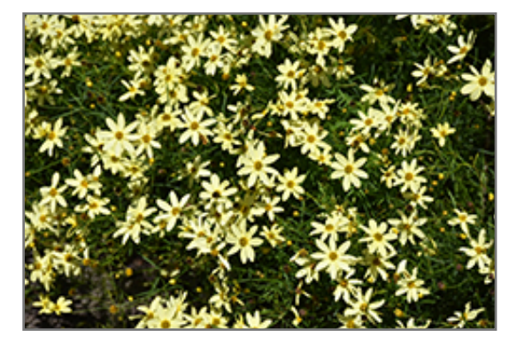
Moonbeam Tickseed flowers

830 W Liberty Dr. Liberty, MO 64068 816.781.0001