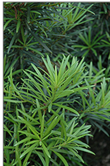
Japanese Yew foliage

When grown indoors, Japanese Yew can be expected to grow to be about 6 feet tall at maturity, with a spread of 3 feet. It grows at a slow rate, and under ideal conditions can be expected to live for approximately 50 years. This houseplant will do well in a location that gets either direct or indirect sunlight, although it will usually require a more brightly-lit environment than what artificial indoor lighting alone can provide. It does best in average to evenly moist soil, but will not tolerate standing water. The surface of the soil shouldn't be allowed to dry out completely, and so you should expect to water this plant once and possibly even twice each week. Be aware that your particular watering schedule may vary depending on its location in the room, the pot size, plant size and other conditions; if in doubt, ask one of our experts in the store for advice. It is not particular as to soil type or pH; an average potting soil should work just fine.