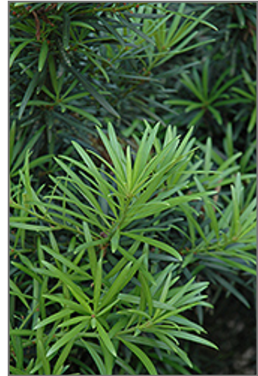
Japanese Yew foliage

When grown indoors, Japanese Yew can be expected to grow to be about 6 feet tall at maturity, with a spread of 3 feet. It grows at a slow rate, and under ideal conditions can be expected to live for approximately 50 years. This houseplant will do well in a location that gets either direct or indirect sunlight, although it will usually require a more brightly-lit environment than what artificial indoor lighting alone can provide. It does best in average to evenly moist soil, but will not tolerate standing water. The surface of the soil shouldn't be allowed to dry out completely, and so you should expect to water this plant once and possibly even twice each week. Be aware that your particular watering schedule may vary depending on its location in the room, the pot size, plant size and other conditions; if in doubt, ask one of our experts in the store for advice. It is not particular as to soil type or pH; an average potting soil should work just fine.