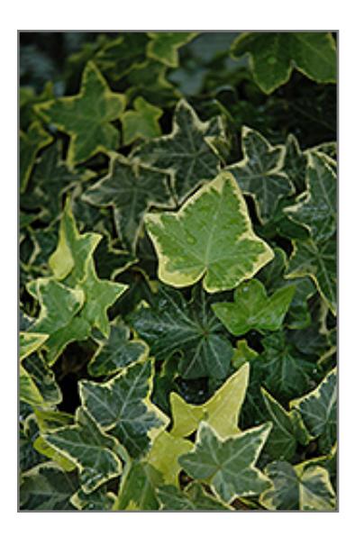
Gold Child Ivy foliage

When grown indoors, Gold Child Ivy can be expected to grow to be about 10 feet tall at maturity, with a spread of 3 feet. It grows at a medium rate, and under ideal conditions can be expected to live for approximately 30 years. This houseplant performs well in both bright or indirect sunlight and strong artificial light, and can therefore be situated in almost any well-lit room or location. It prefers to grow in average to moist soil. The surface of the soil shouldn't be allowed to dry out completely, and so you should expect to water this plant once and possibly even twice each week. Be aware that your particular watering schedule may vary depending on its location in the room, the pot size, plant size and other conditions; if in doubt, ask one of our experts in the store for advice. It is not particular as to soil pH, but grows best in rich soil. Contact the store for specific recommendations on pre-mixed potting soil for this plant. Be warned that parts of this plant are known to be toxic to humans and animals, so special care should be exercised if growing it around children and pets.