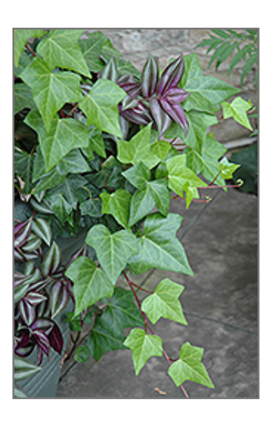
Algerian Ivy foliage

When grown indoors, Algerian Ivy can be expected to grow to be about 10 feet tall at maturity, with a spread of 3 feet. It grows at a fast rate, and under ideal conditions can be expected to live for approximately 30 years. This houseplant performs well in both bright or indirect sunlight and strong artificial light, and can therefore be situated in almost any well-lit room or location. It is very adaptable to both dry and moist soil, and should do just fine under average home conditions. The surface of the soil shouldn't be allowed to dry out completely, and so you should expect to water this plant once and possibly even twice each week. Be aware that your particular watering schedule may vary depending on its location in the room, the pot size, plant size and other conditions; if in doubt, ask one of our experts in the store for advice. It is not particular as to soil pH, but grows best in rich soil. Contact the store for specific recommendations on pre-mixed potting soil for this plant. Be warned that parts of this plant are known to be toxic to humans and animals, so special care should be exercised if growing it around children and pets.