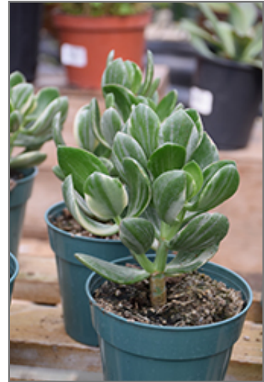
Variegated Jade Plant in full

This is a multi-stemmed evergreen houseplant with an upright spreading habit of growth. This plant can be pruned at any time to keep it looking its best.