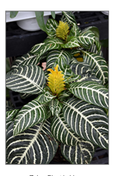
Zebra Plant in bloom

When grown indoors, Zebra Plant can be expected to grow to be about 24 inches tall at maturity extending to 3 feet tall with the flowers, with a spread of 24 inches. It grows at a medium rate, and under ideal conditions can be expected to live for approximately 10 years. This houseplant should only be grown away from direct sunlight or in a room with strong artificial light. It prefers to grow in average to moist soil. The surface of the soil shouldn't be allowed to dry out completely, and so you should expect to water this plant once and possibly even twice each week. Be aware that your particular watering schedule may vary depending on its location in the room, the pot size, plant size and other conditions; if in doubt, ask one of our experts in the store for advice. It is not particular as to soil type or pH; an average potting soil should work just fine.