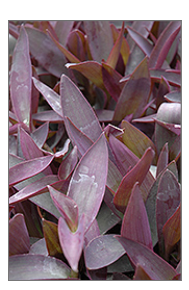
Purple Heart foliage

There are many factors that will affect the ultimate height, spread and overall performance of a plant when grown indoors; among them, the size of the pot it's growing in, the amount of light it receives, watering frequency, the pruning regimen and repotting schedule. Use the information described here as a guideline only; individual performance can and will vary. Please contact the store to speak with one of our experts if you are interested in further details concerning recommendations on pot size, watering, pruning, repotting, etc.