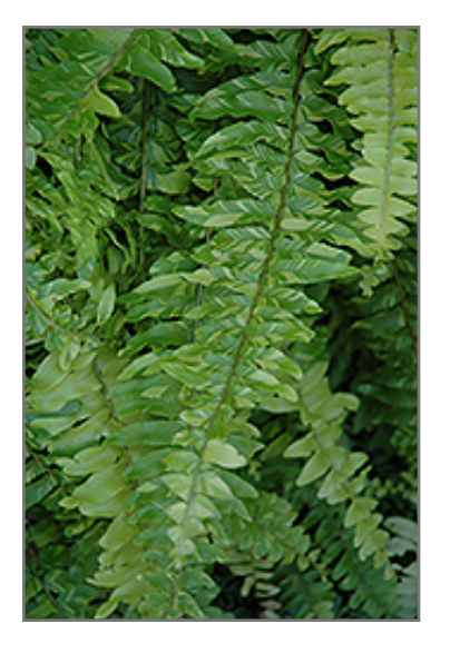
Variegated Boston Fern foliage

830 W Liberty Dr. Liberty, MO 64068 816.781.0001