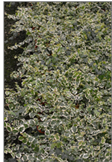
Variegated Creeping Fig in full