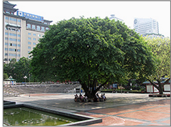
Indian Laurel Fig

This is a multi-stemmed evergreen houseplant with a more or less rounded form. This plant may benefit from an occasional pruning to look its best.