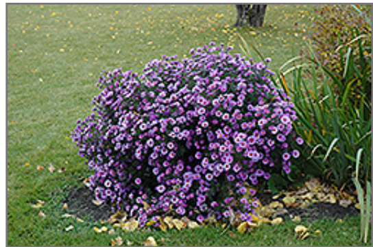
Purple Dome Aster in bloom