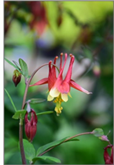
Wild Red Columbine flowers

Wild Red Columbine is recommended for the following landscape applications;