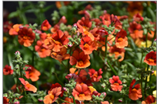
Sunsatia Blood Orange Nemesia flowers