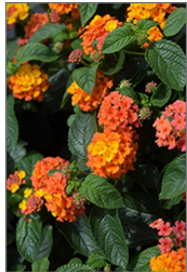
Lucky Flame Lantana flowers