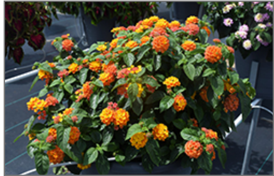
Lucky Flame Lantana in bloom

Lucky Flame Lantana is a fine choice for the garden, but it is also a good selection for planting in outdoor containers and hanging baskets. It is often used as a 'filler' in the 'spiller-thriller-filler' container combination, providing a mass of flowers against which the thriller plants stand out. Note that when growing plants in outdoor containers and baskets, they may require more frequent waterings than they would in the yard or garden.