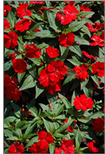
Divine Scarlet Red New Guinea Impatiens flowers