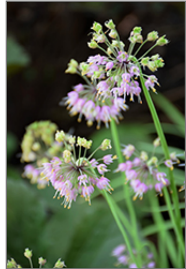
Nodding Onion flowers

This plant should only be grown in full sunlight. It does best in average to evenly moist conditions, but will not tolerate standing water. It is not particular as to soil type or pH, and is able to handle environmental salt. It is highly tolerant of urban pollution and will even thrive in inner city environments. This species is native to parts of North America. It can be propagated by multiplication of the underground bulbs.