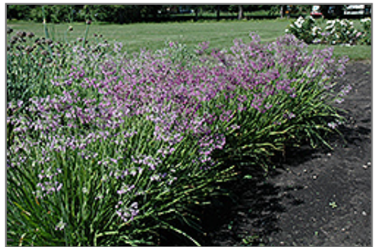
Nodding Onion in bloom