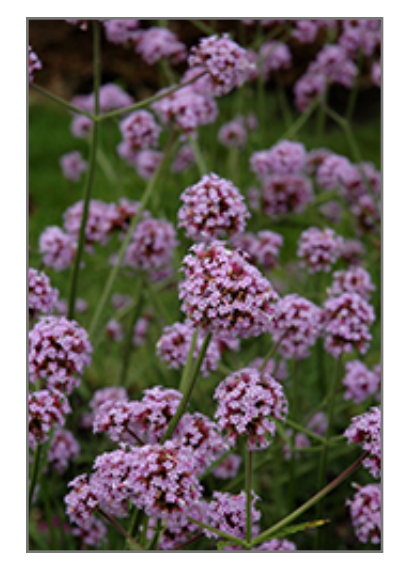
Meteor Shower Verbena flowers

830 W Liberty Dr. Liberty, MO 64068 816.781.0001