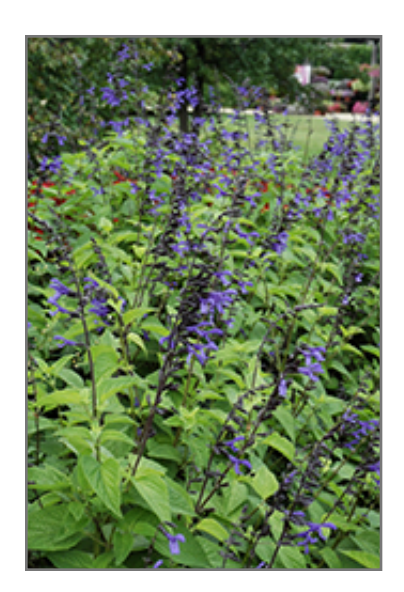
Black & Bloom Sage in bloom