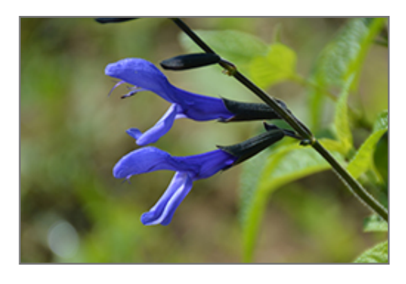
Black & Bloom Sage flowers

830 W Liberty Dr. Liberty, MO 64068 816.781.0001