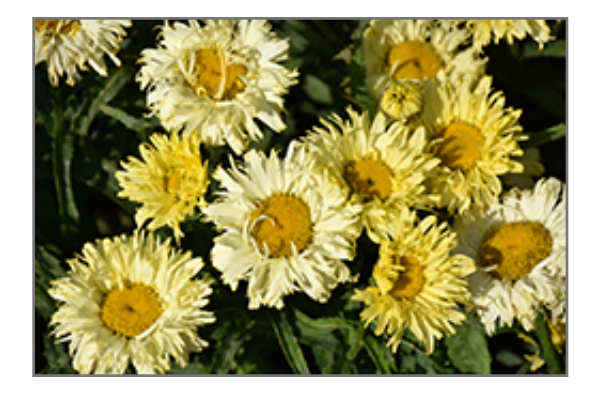
Goldfinch Shasta Daisy flowers

830 W Liberty Dr. Liberty, MO 64068 816.781.0001