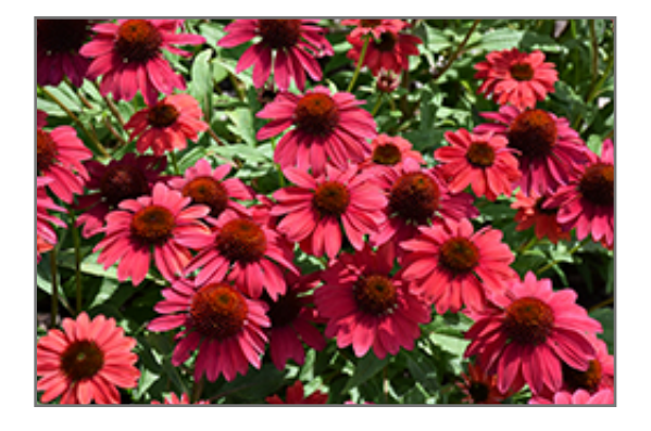
Sombrero Baja Burgundy Coneflower flowers

830 W Liberty Dr. Liberty, MO 64068 816.781.0001