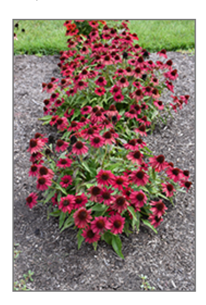
Sombrero Baja Burgundy Coneflower in bloom