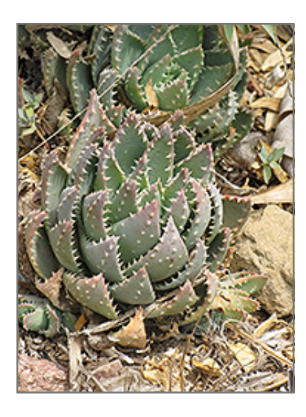
Short-leaved Aloe

Short-leaved Aloe is recommended for the following landscape applications;