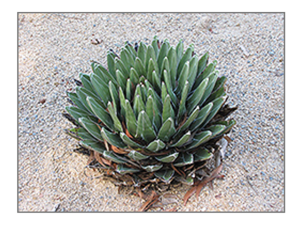
Queen Victoria Agave

830 W Liberty Dr. Liberty, MO 64068 816.781.0001