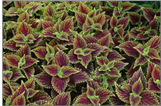
Coleosaurus Coleus foliage

Other Names: Flame Nettle, Painted Nettle