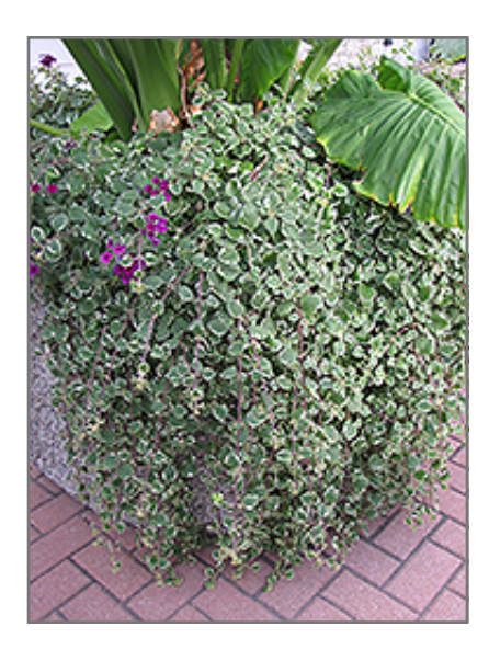
Swedish Ivy