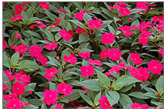
Bounce Cherry Impatiens in bloom