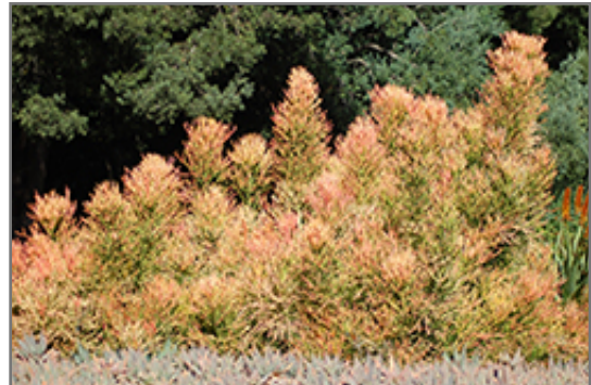
Sticks On Fire Red Pencil Tree