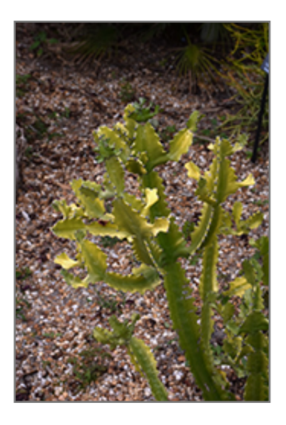
African Candelabra foliage

This shrub does best in full sun to partial shade. It prefers dry to average moisture levels with very well-drained soil, and will often die in standing water. It is considered to be drought-tolerant, and thus makes an ideal choice for xeriscaping or the moisture-conserving landscape. It is not particular as to soil pH, but grows best in sandy soils. It is highly tolerant of urban pollution and will even thrive in inner city environments. This species is not originally from North America, and parts of it are known to be toxic to humans and animals, so care should be exercised in planting it around children and pets.