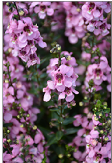
Serenita Pink Angelonia flowers