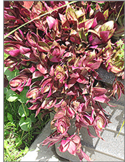
Purple Wandering Jew

Purple Wandering Jew is recommended for the following landscape applications;