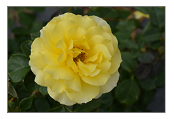
Sparkle And Shine Rose flowers