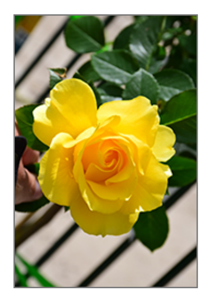
Sparkle And Shine Rose flowers

7036 Nieman Shawnee, KS 66203 913.631.6121