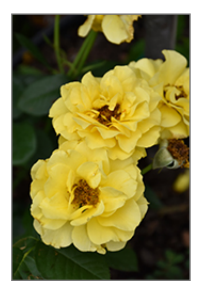
Sparkle And Shine Rose flowers

This shrub should only be grown in full sunlight. It does best in average to evenly moist conditions, but will not tolerate standing water. It is not particular as to soil type or pH. It is highly tolerant of urban pollution and will even thrive in inner city environments. This particular variety is an interspecific hybrid.