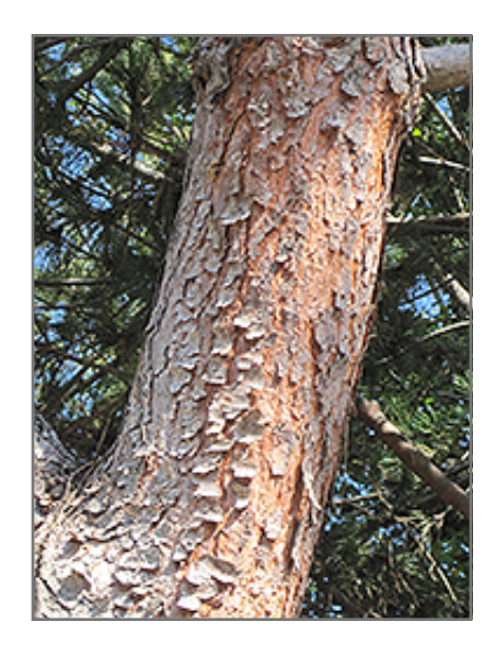
Stone Pine bark