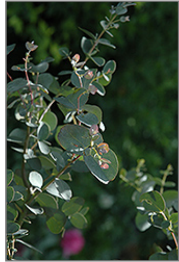
Silver Drop Cider Gum foliage