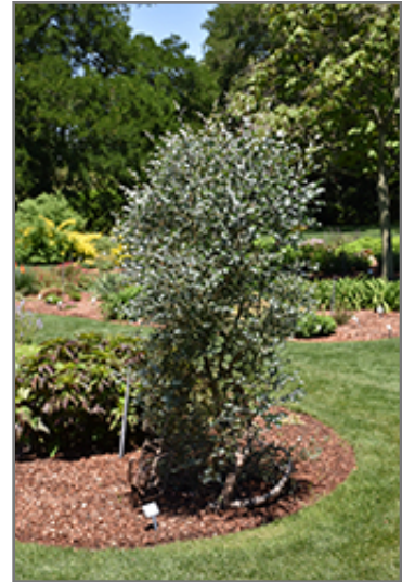
Silver Drop Cider Gum

Silver Drop Cider Gum makes a fine choice for the outdoor landscape, but it is also well-suited for use in outdoor pots and containers. With its upright habit of growth, it is best suited for use as a 'thriller' in the 'spiller-thriller-filler' container combination; plant it near the center of the pot, surrounded by smaller plants and those that spill over the edges. It is even sizeable enough that it can be grown alone in a suitable container. Note that when grown in a container, it may not perform exactly as indicated on the tag - this is to be expected. Also note that when growing plants in outdoor containers and baskets, they may require more frequent waterings than they would in the yard or garden.