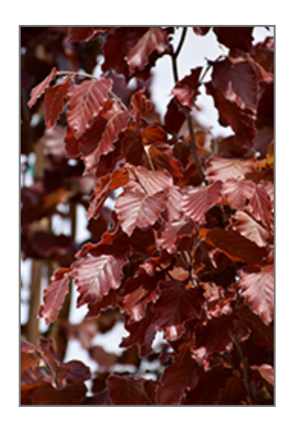
Red Obelisk Beech foliage

7036 Nieman Shawnee, KS 66203 913.631.6121