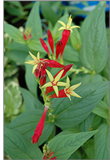
Indian Pink flowers

Indian Pink is recommended for the following landscape applications;