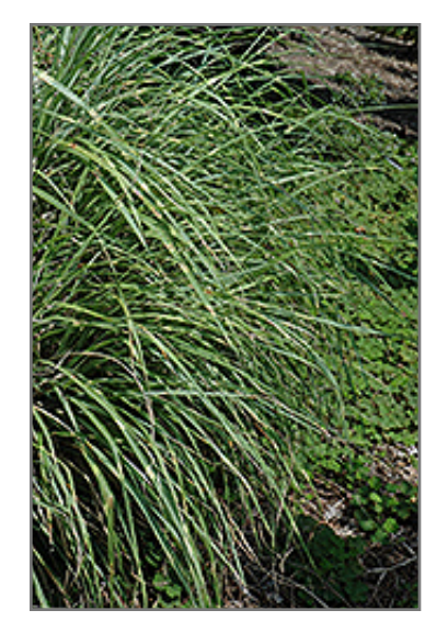
Little Zebra Dwarf Maiden Grass foliage