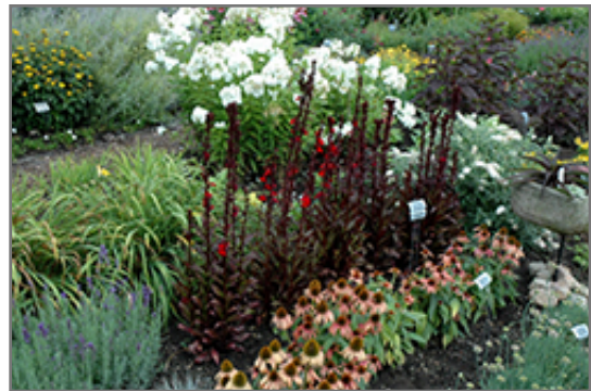
Vulcan Red Lobelia in bloom