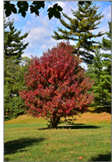
Redpointe Red Maple in fall

This tree should only be grown in full sunlight. It is quite adaptable, preferring to grow in average to wet conditions, and will even tolerate some standing water. It is not particular as to soil type, but has a definite preference for acidic soils, and is subject to chlorosis (yellowing) of the foliage in alkaline soils. It is somewhat tolerant of urban pollution. This is a selection of a native North American species.