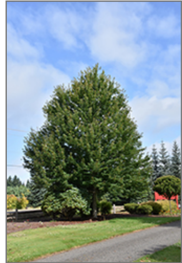
Redpointe Red Maple