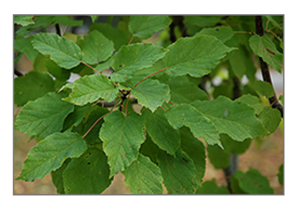
Pattern Perfect Tatarian Maple foliage

Pattern Perfect Tatarian Maple is recommended for the following landscape applications;