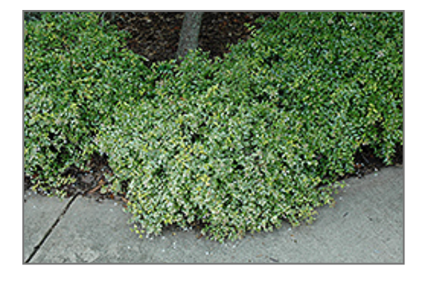
Hopley's Abelia

Hopley's Abelia is recommended for the following landscape applications;