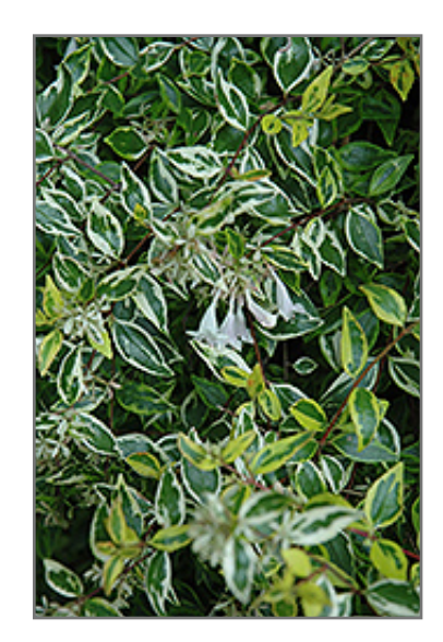
Hopley's Abelia flowers

8424 Farley St. Overland Park, KS 66212 913.642.6503