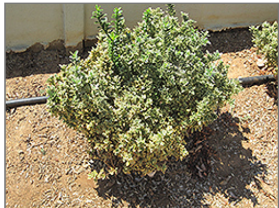
Variegated Boxleaf Japanese Euonymus